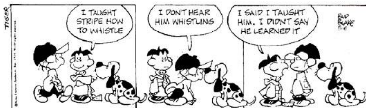
Figure 1: Shift from teaching to learning (Blake, n.d.; quoted from Northern Illinois University, n.d.)

The fact that it is not a transfer of knowledge from the lecturers but an acquisition of skills which is desired in teaching is described as shift from teaching to learning. This is illustrated in figure 1.